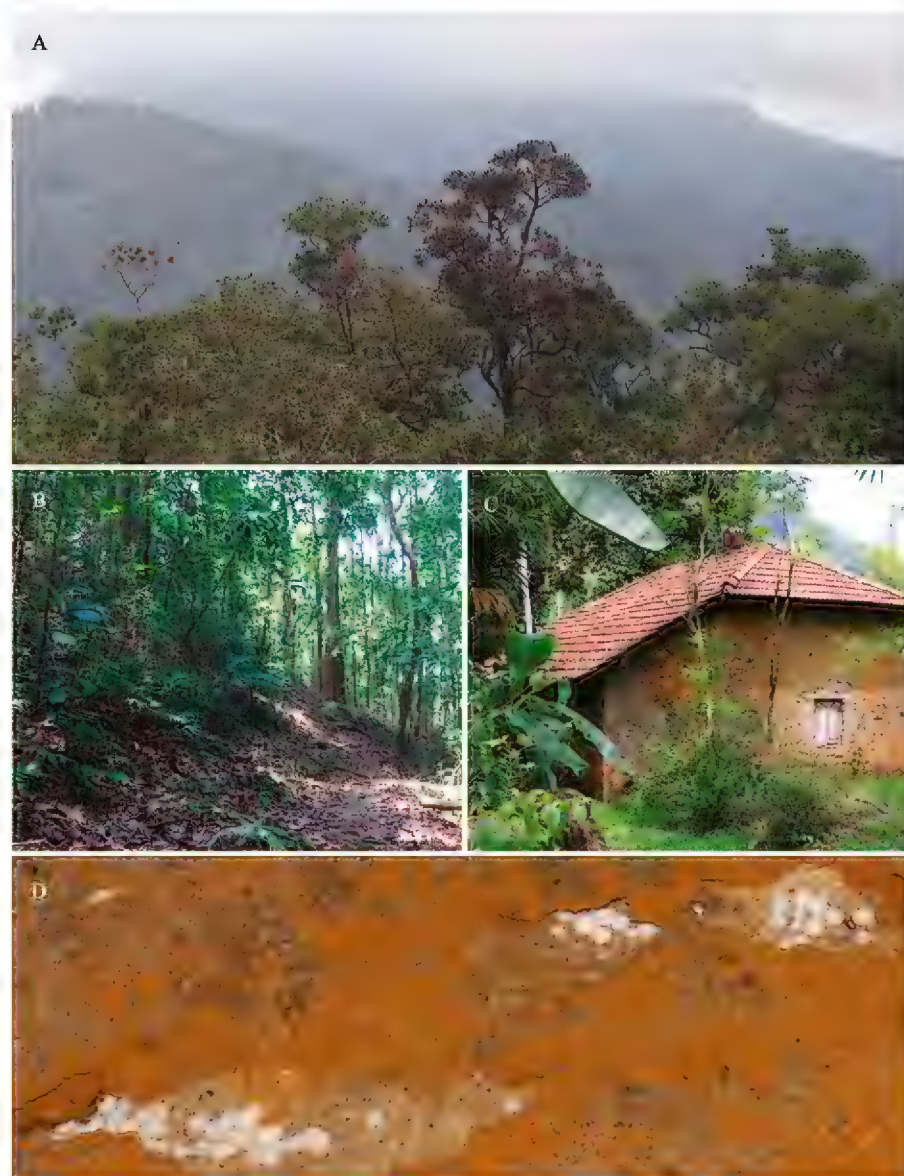
Fig. 5. General habitat of Cnemaspis anslemi sp. nov. at Udamaliboda, Samanala Nature Reserve, Kegalle District, Sri Lanka. (A) Complete view of the forest hill, (B) shady forest with thick leaf litter, (C) hundred years old house made using clay and bricks, also with wattle and daub, (D) communal egg laying site on a clay wall.

Natural history. The lower Samanala Nature Reserve area (along with Udamaliboda) comprises home gardens, and tropical evergreen rainforests (Gunatileke and Gunatileke 1990) mixed with tea and rubber plantations. The area comprises the Ratnapura and Kegalle districts and lies between 6.759172° and 6.889842°N and 80.436194° and 80.487717°E, at an elevation of 350–850 m. The mean annual rainfall varies between 3,500 and 4,500 mm, received mostly via the southwest monsoon (May–September). The mean annual temperature of the area is 26.4–27.9 °C. Cnemaspis anslemi sp. nov. is a quite rare species as six ( \pm 0.1 ) geckos per survey-hour were found after covering a total area of 20 ha. This species was restricted to tall straight trees with smooth bark and thick canopy cover, and houses with tall clay walls with crevices. These geckos could climb up to 7 m on vertical surfaces of trees (Fig. 5). They were active during the day